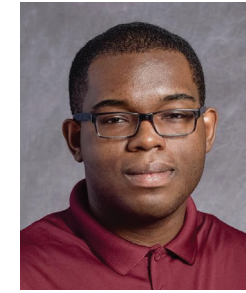
Breville Blackman '24